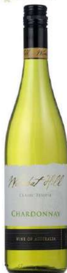
WOMBAT HILL CHARDONNAY 2016