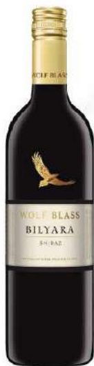
BILYARA SHIRAZ 2017